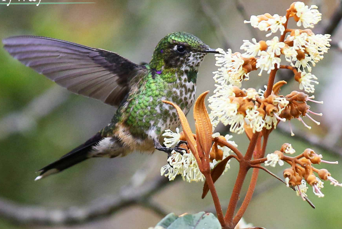
Purple-backed Thornbill ( Ramphomicron microrhynchum ) by Rick Greenspun