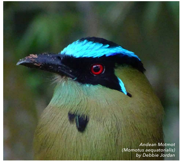
Andean Motmot ( Momotus aequatorialis)