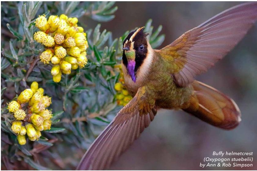
Buffy helmetcrest ( Oxygogon stuebelii)